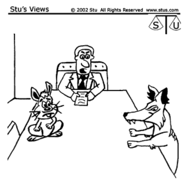
"Please, Mr. Wolf, now we're just splitting hares."

"Communicating is depositing a part of yourself in the other." Anonymous